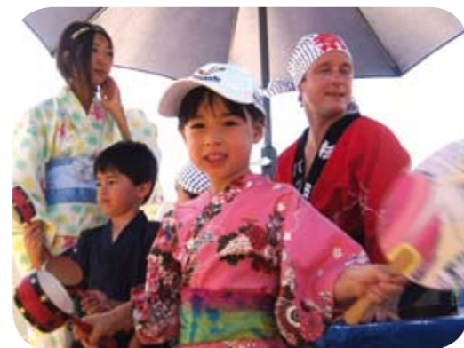
A taste of Japan in the Busselton Festival Float Parade.

Traditionally the Mikoshi often resemble a small building and are carried while praying for a rich harvest, protection at home and a prosperous business. The performance also