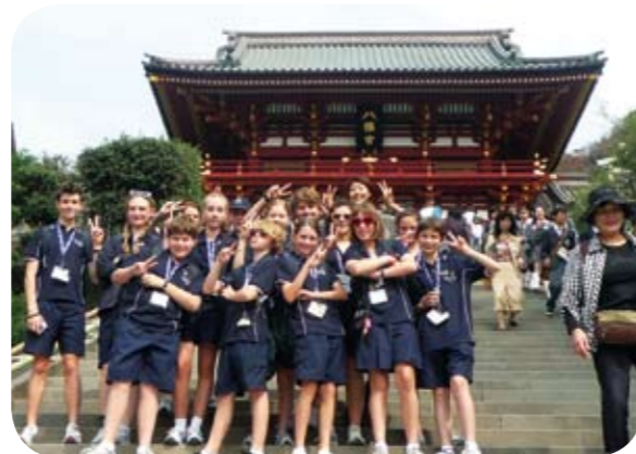
South West students visit a shrine in Setagaya.

Students also had the privilege to meet and perform to the new Mayor of Setagaya, Mayor Nobuto Hosaka and the Setagaya City Assembly. The Mayor "tweeted" the next day that he thoroughly enjoyed the students and that "he was moved by Furusato (Home Town)